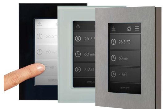
The external display in three versions

The cleverly designed magnetic frame construction, however, also allows steam bath builders to individualize the fitting with a material of the customer's liking.