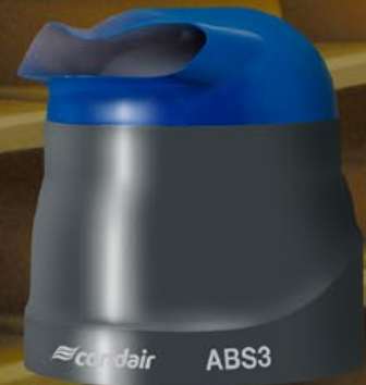
Condair ABS3: Double Strength

The Condair 3001 really comes into its own in industrial and commercial premises with a room volume of 500 m 3 . The deflector hood directs the aerosol mist exactly where you require it, as the outlet can be continuously adjusted. The Condair 3001 is equipped with a manually-filled tank, or fully-automatic operation is also possible (i.e. by connecting it to the mains water supply). The thermal overload switch deactivates the unit if the water level drops too low, ensuring maximum operating safety.