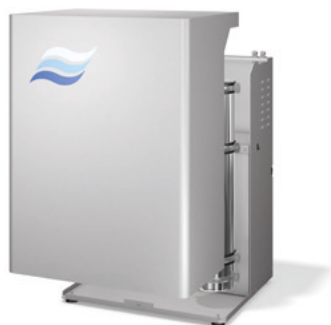
a Housing (optional) with easy access for maintenance